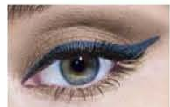
32516 Heavy Metal