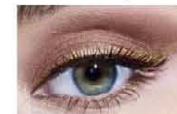
59808 Show Off Sugar*