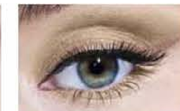
32706 Opal Drops