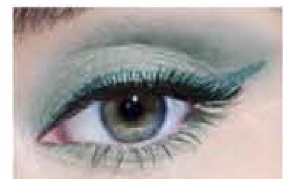
53793 Teal Dream