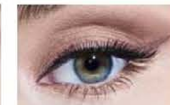
31690 Toasted Pink