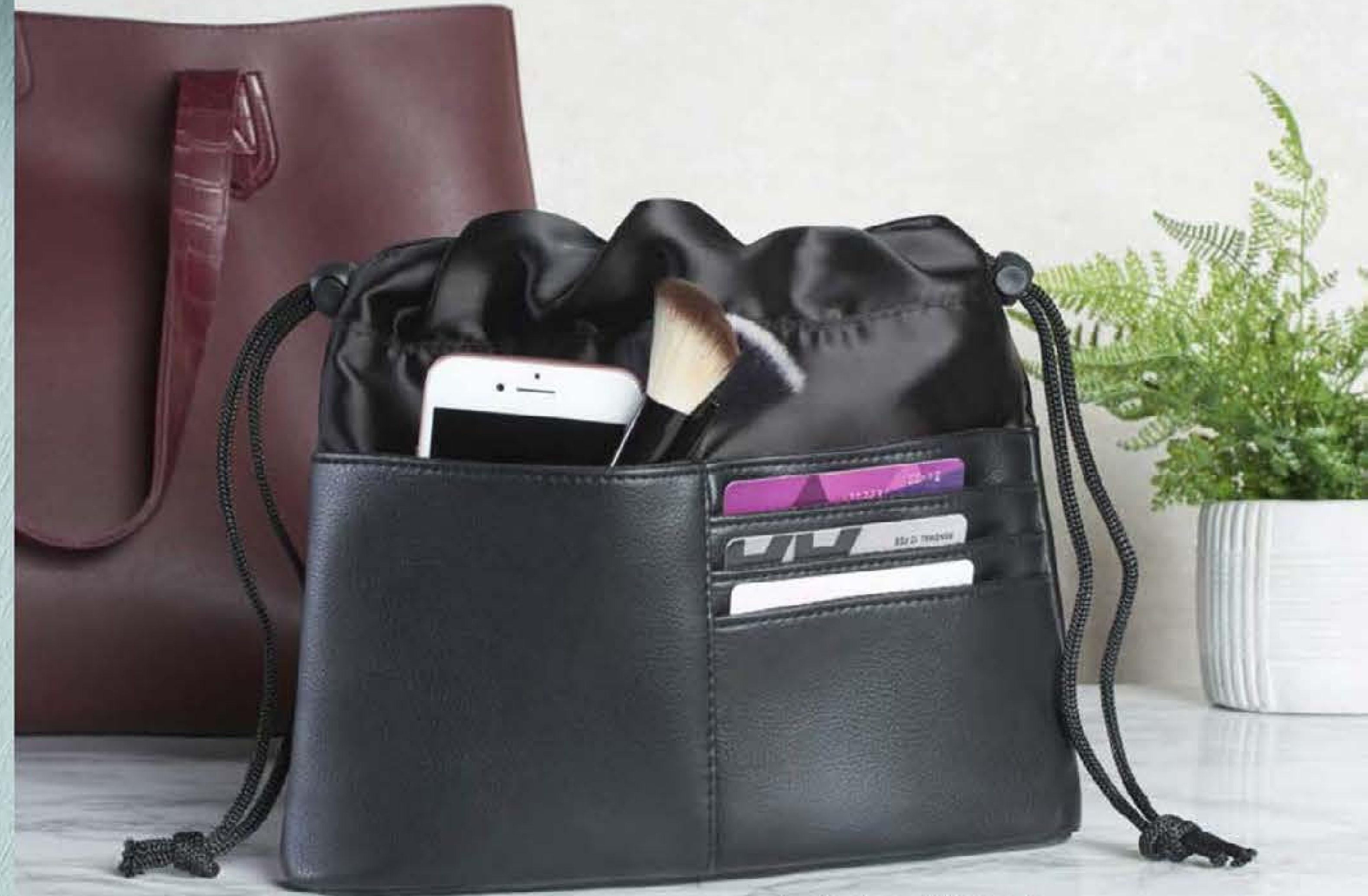
includes different pockets and card compartments

Create your own video to show how to use the fab organiser and bring it to life!