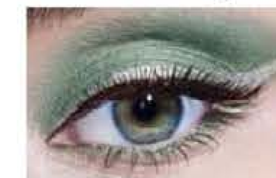
59485 Drama Green*