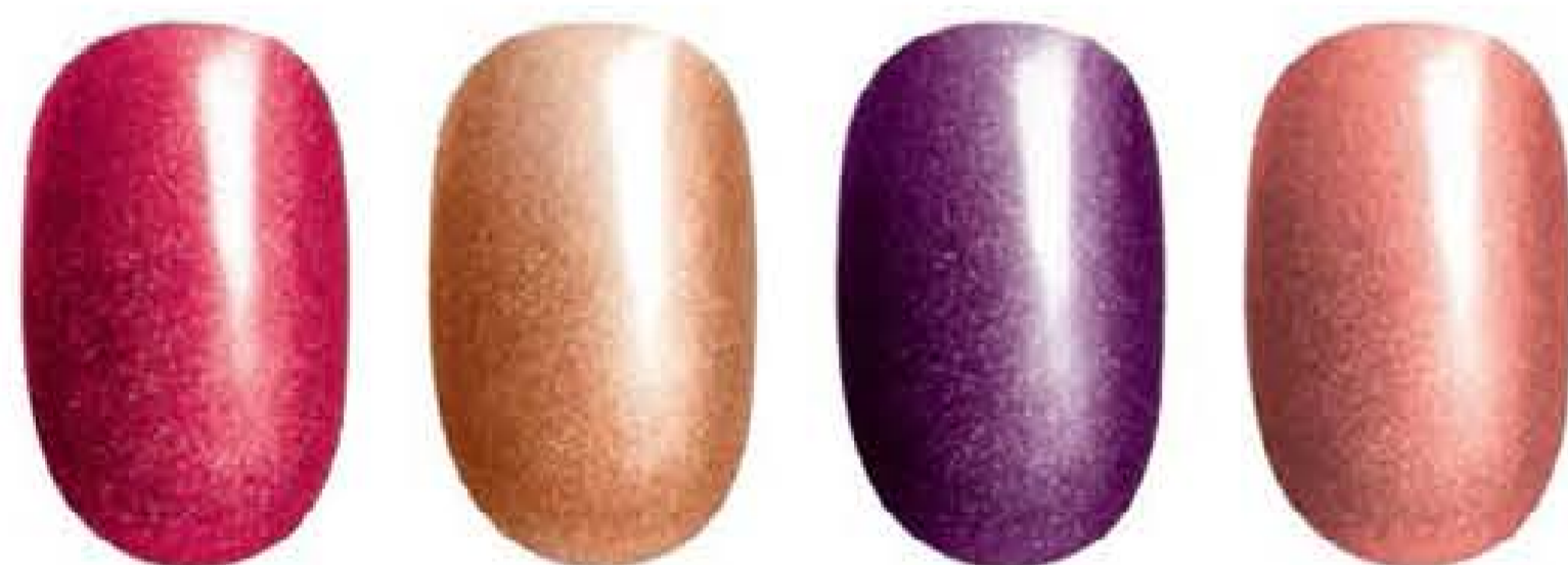
57380 Office Party