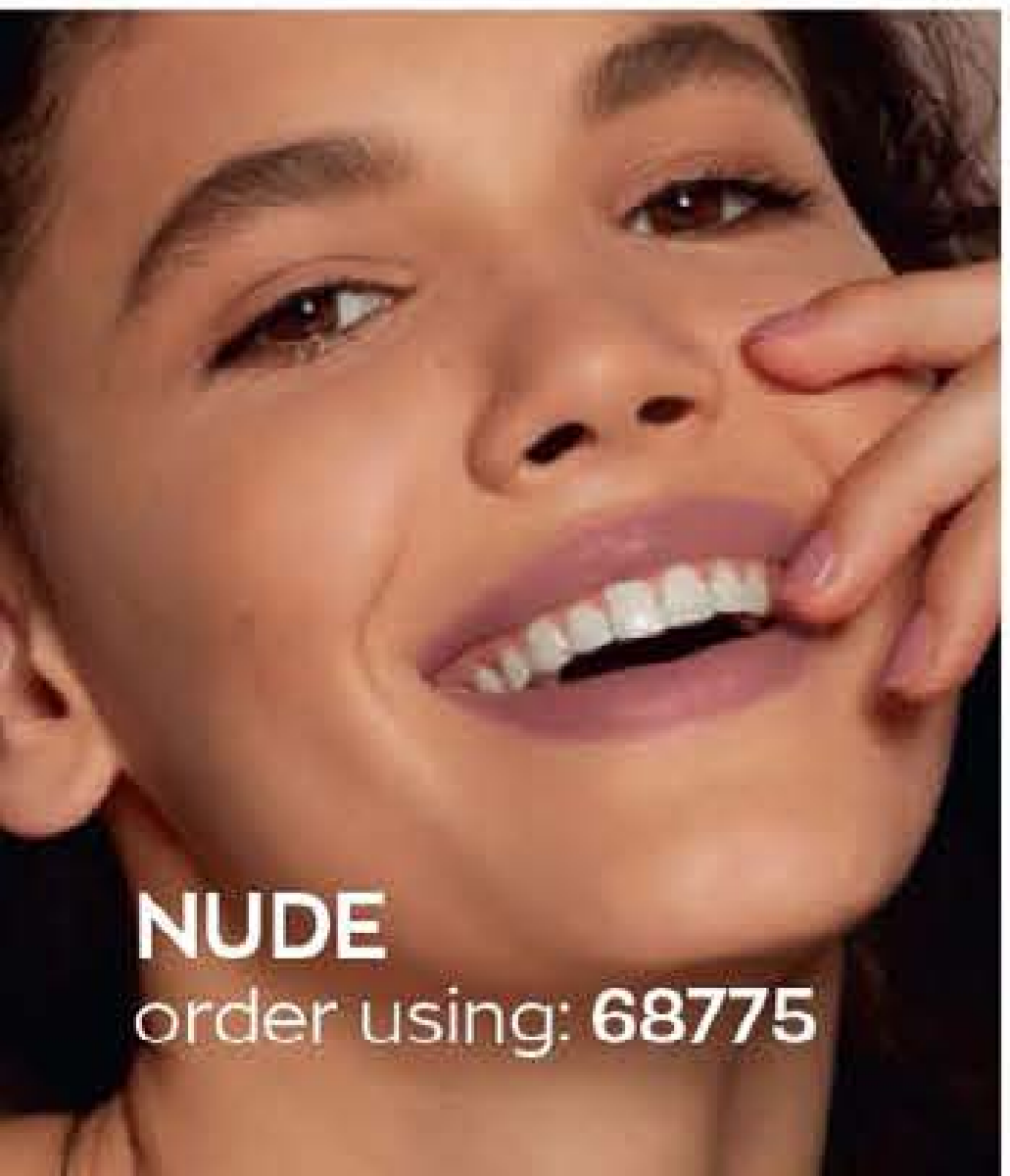
NUDE order using: 68775

TAP HERE TO SEE ALL THE FREE GIFTS AND PICK YOURS