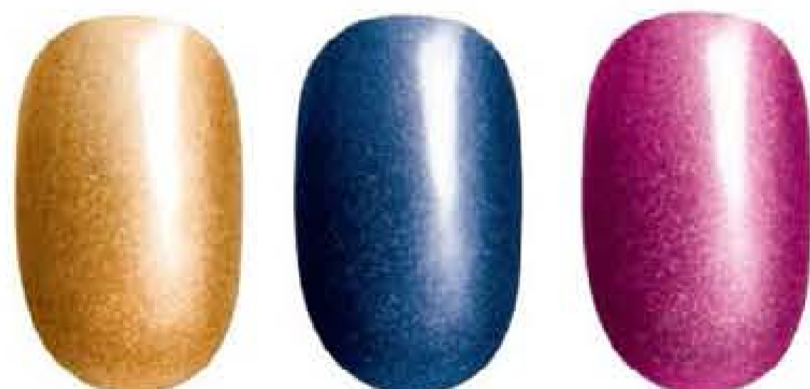
56895 Glitz And Glazed