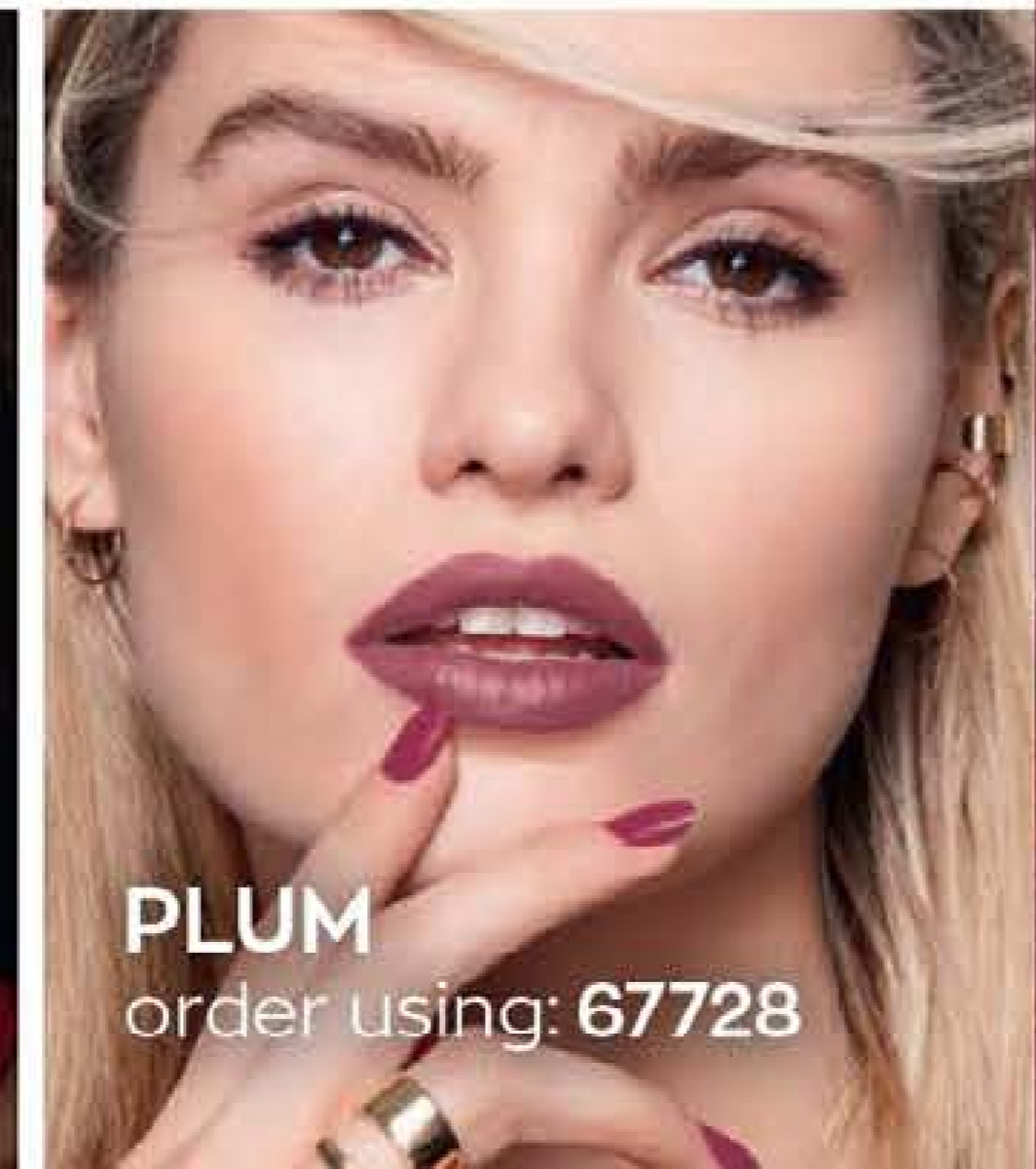
PLUM order using: 67728