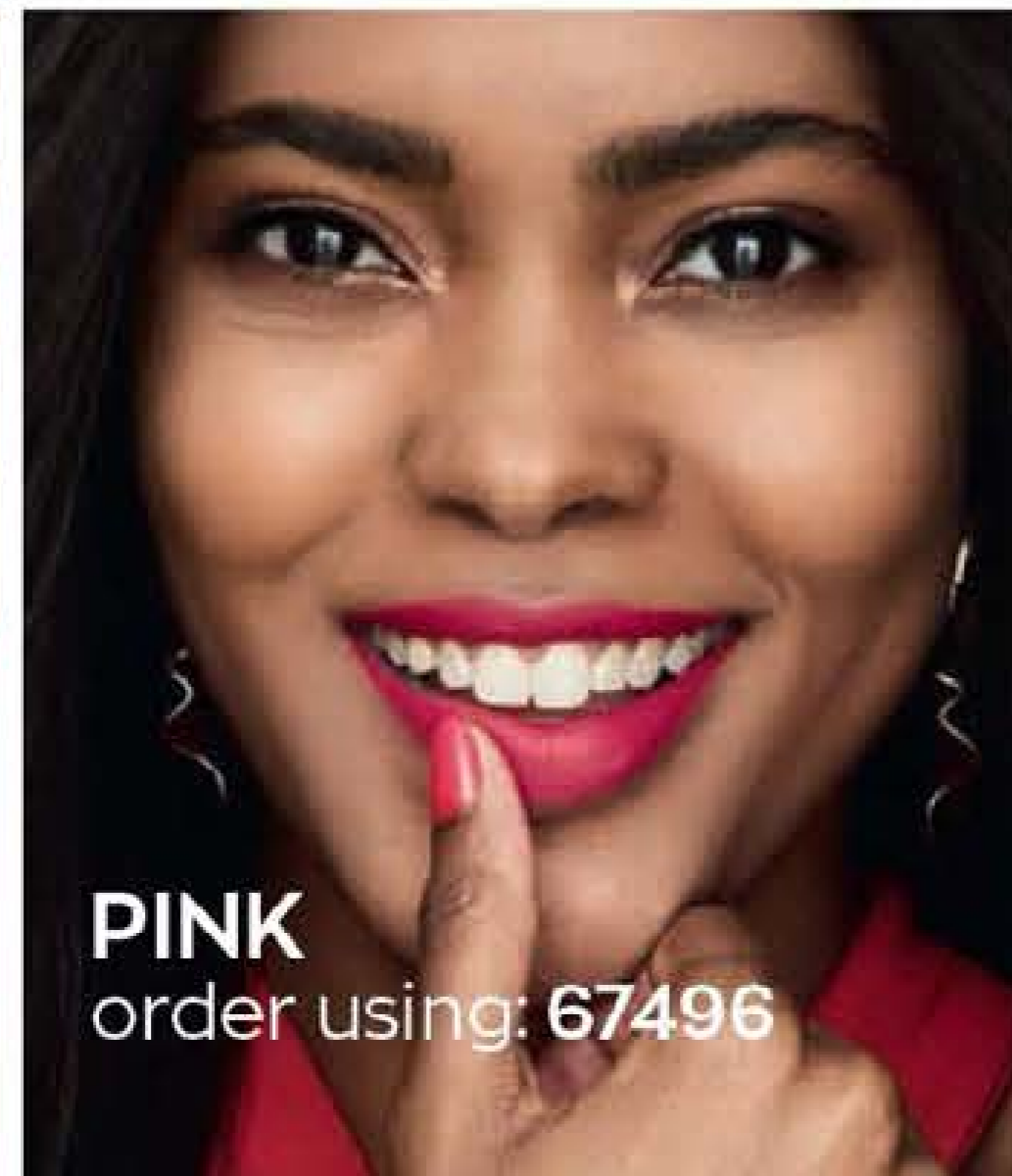
PINK order using: 67496