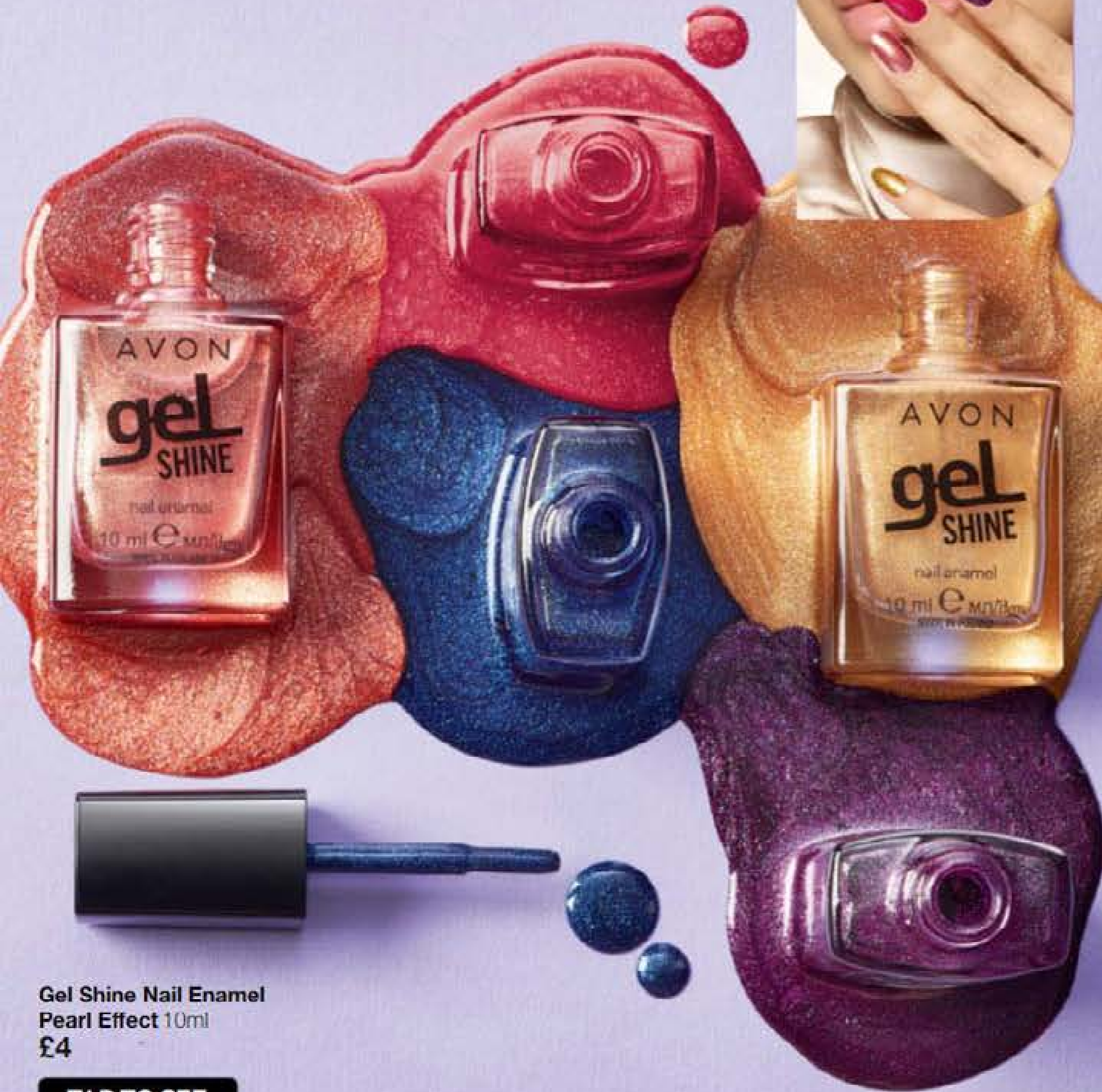
Gel Shine Nail Enamel Pearl Effect 10ml £4