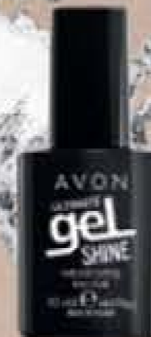
Gel Shine Nail Enamel 10ml £4