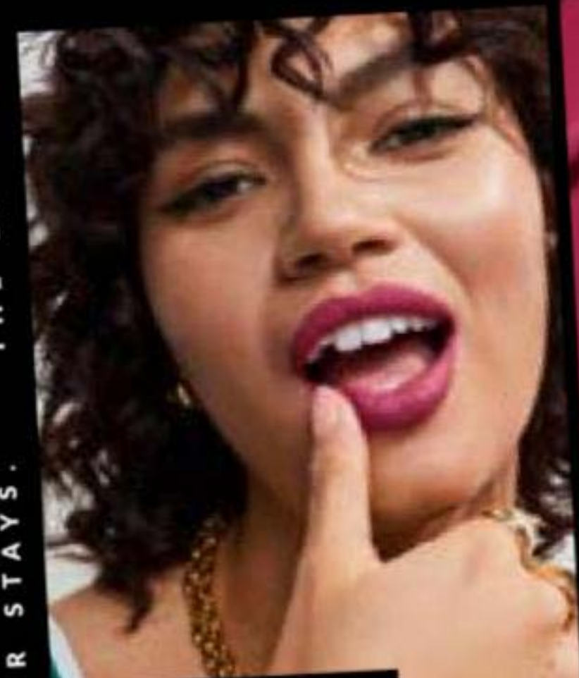
THE COMFORT STAYS