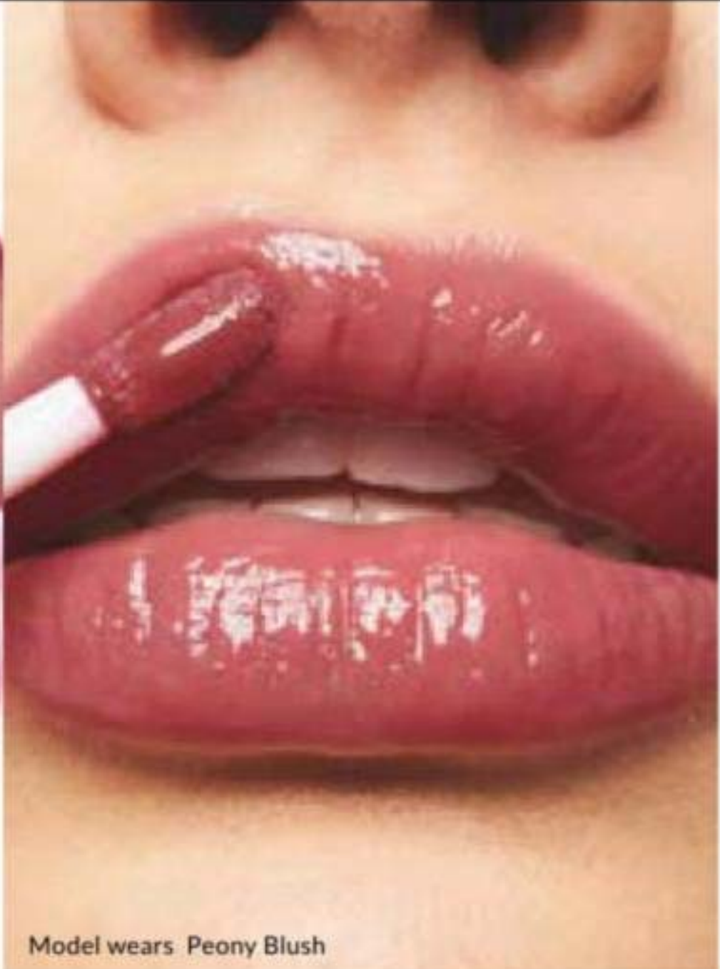
Model wears Peony Blush

Think all lip glosses are created equal? Think again. Meet the oil-infused, juicy colour that doesn't feel sticky.