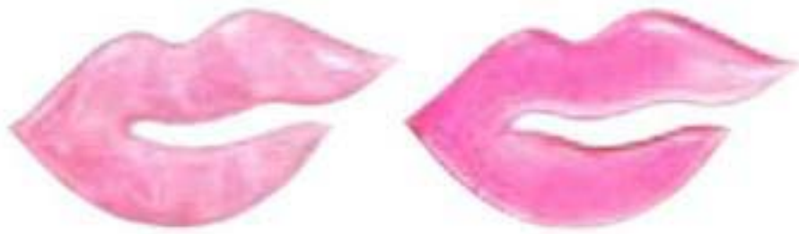
Shimmering Petal 06585

Lock in caring moisture with nourishing oils, glossy shine and SPF12.