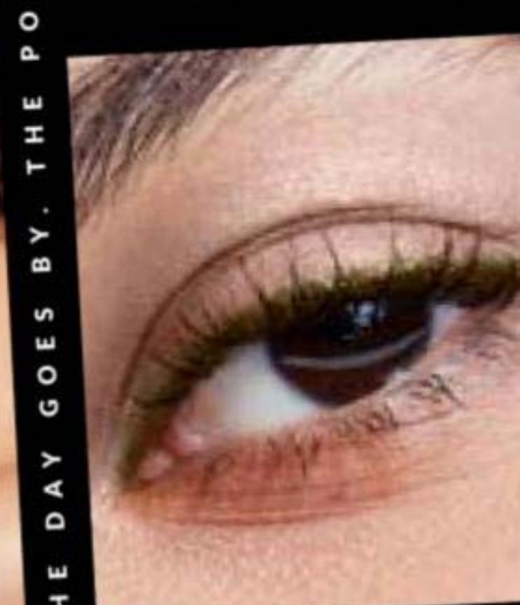
THE POWERFUL LOOK STAYS