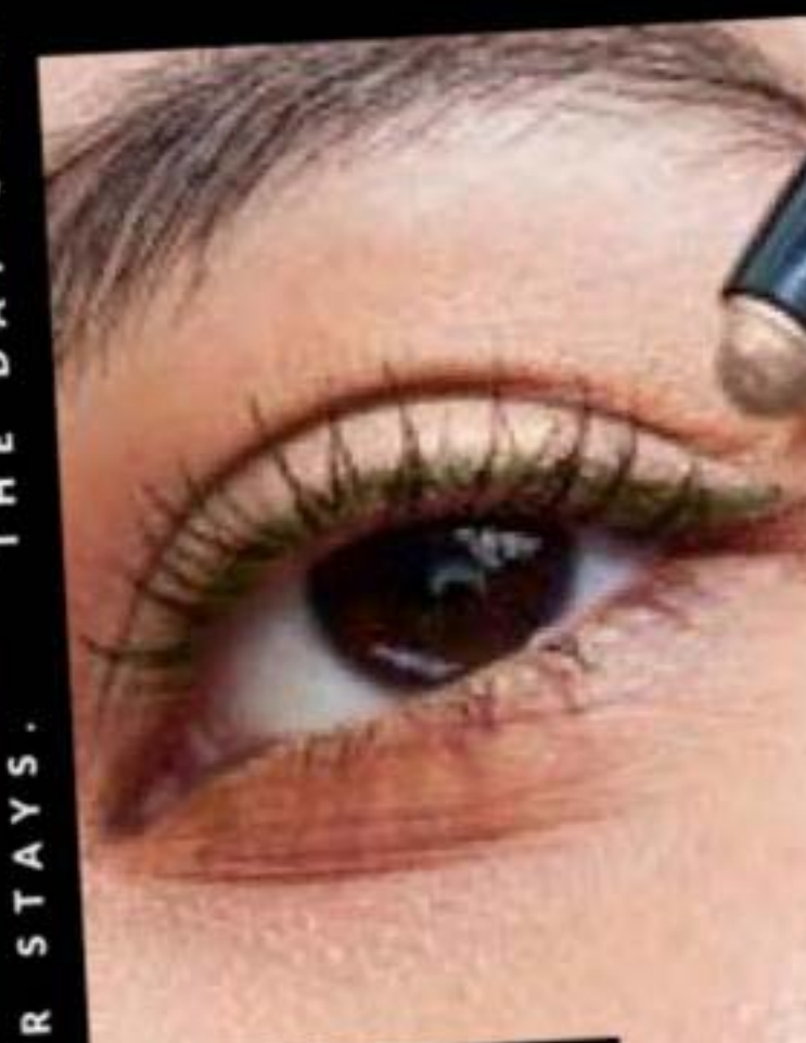
THE SHADOW STAYS