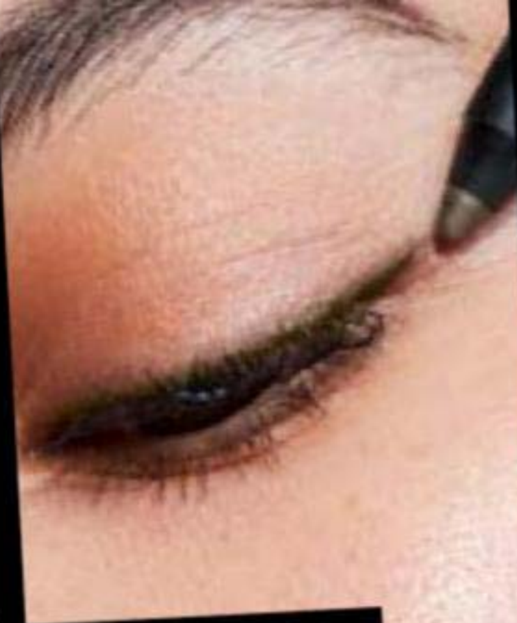
THE GEL LINER STAYS