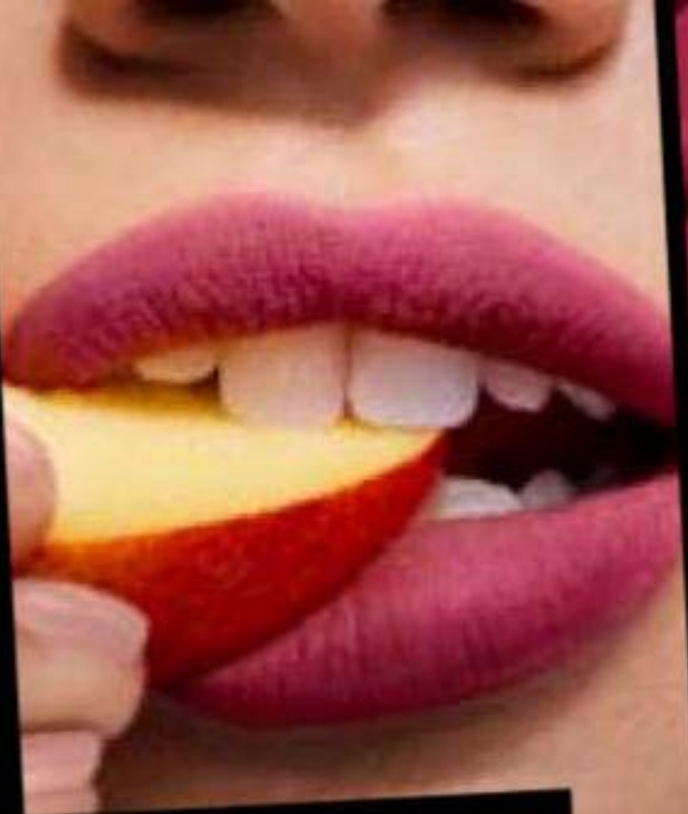
THE MATTE COLOUR STAYS