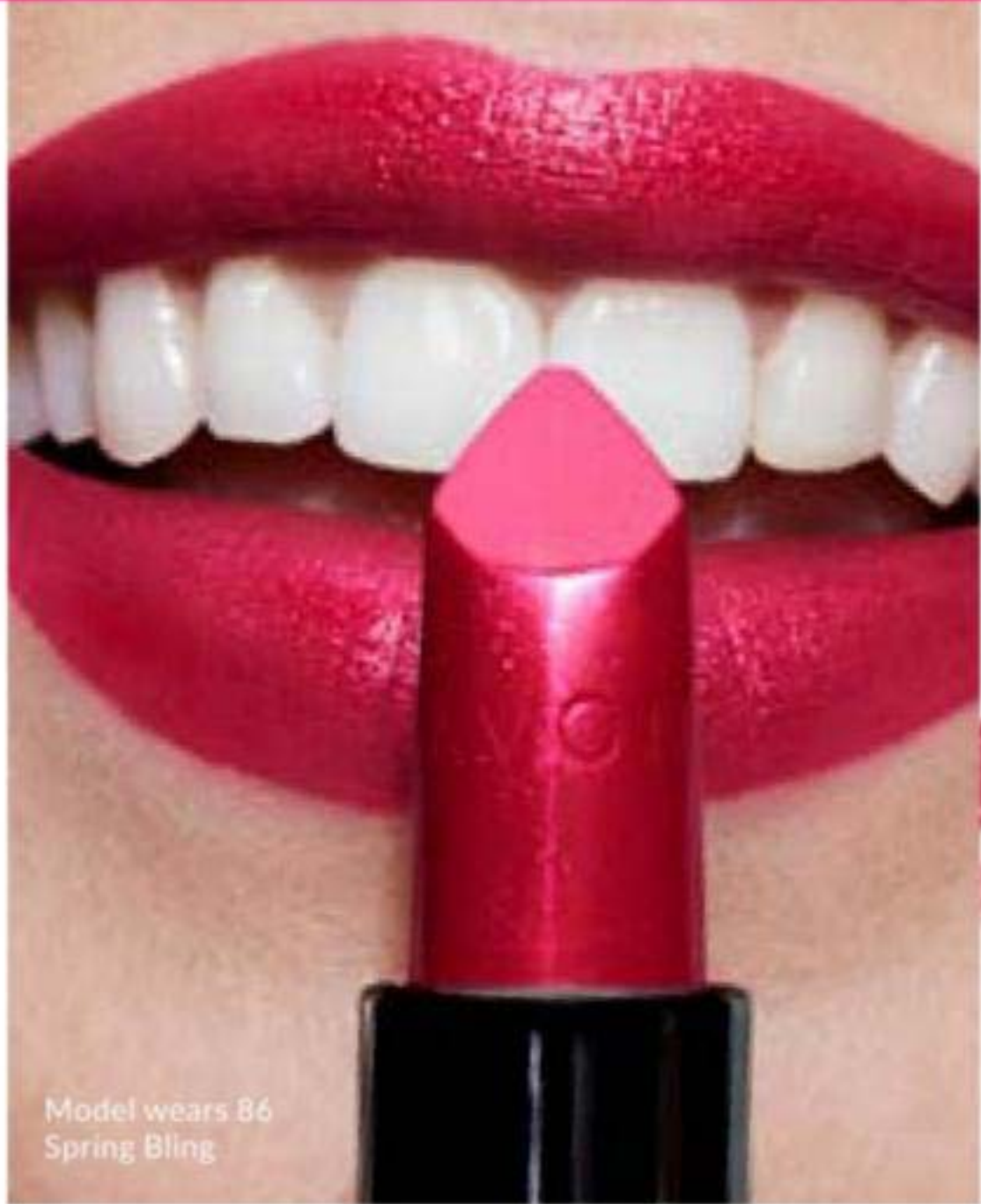
Model wears 86 Spring Bling