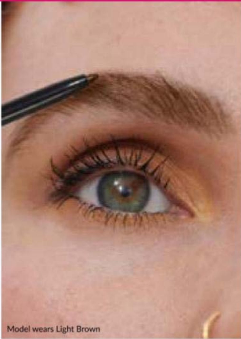
Model wears Light Brown

Our thinnest ever tip mimics micro-fine hairs to create the natural-looking defined brows your feed is full of.