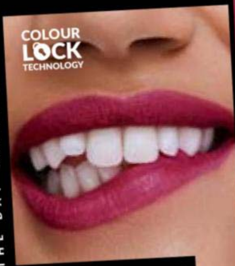
THE UNSTOPPABLE FEELING STAYS