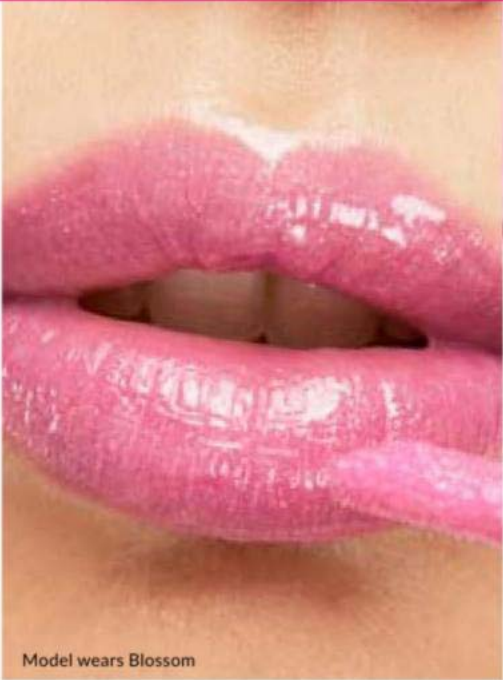
Model wears Blossom

Lock in caring moisture with nourishing oils, glossy shine and SPF12.