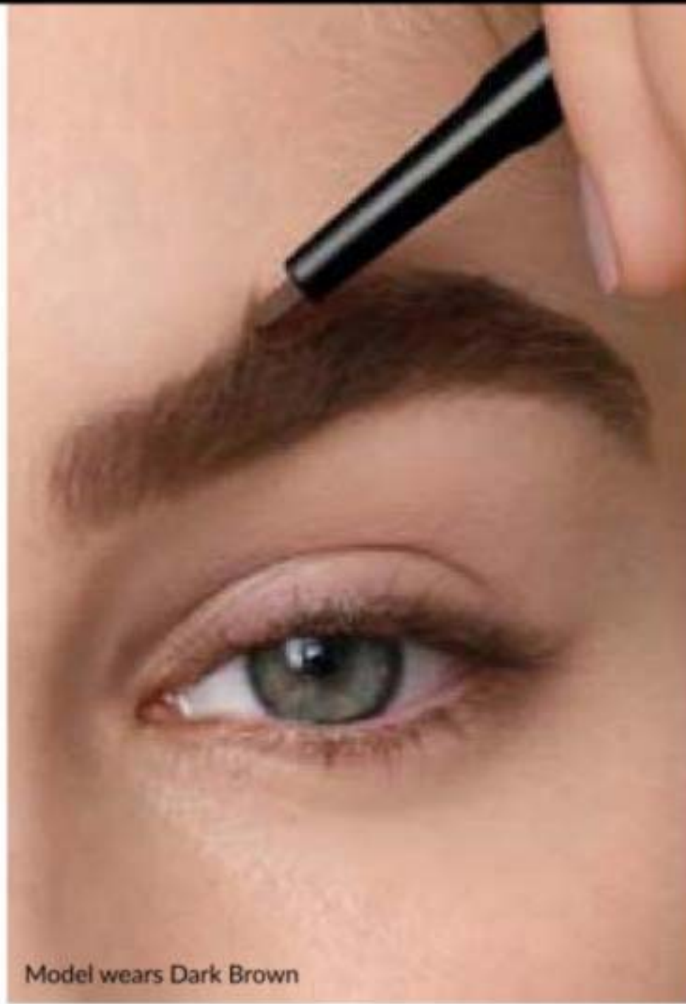
Model wears Dark Brown

Creamy, slanted-tip brow definer for a bold, pro look in seconds.