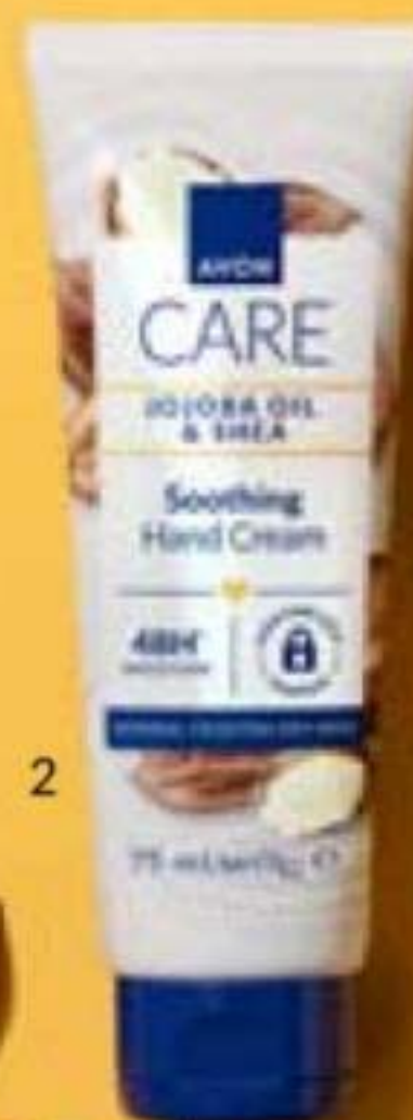
2. Jojoba Oil & Shea Soothing Hand Cream