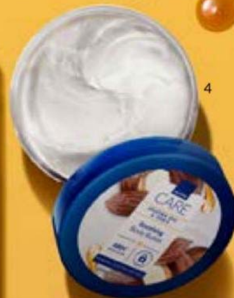
4. Jojoba Oil & Shea Soothing Body Butter