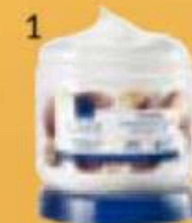
1. Jojoba Oil & Shea Soothing Multipurpose Cream