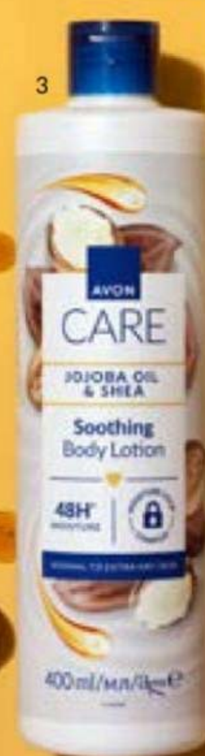
3. Jojoba Oil & Shea Soothing Body Lotion