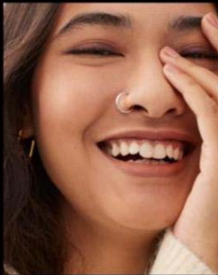
THE COVERAGE STAYS