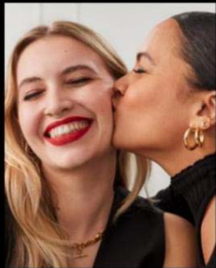
THE KISS STAYS