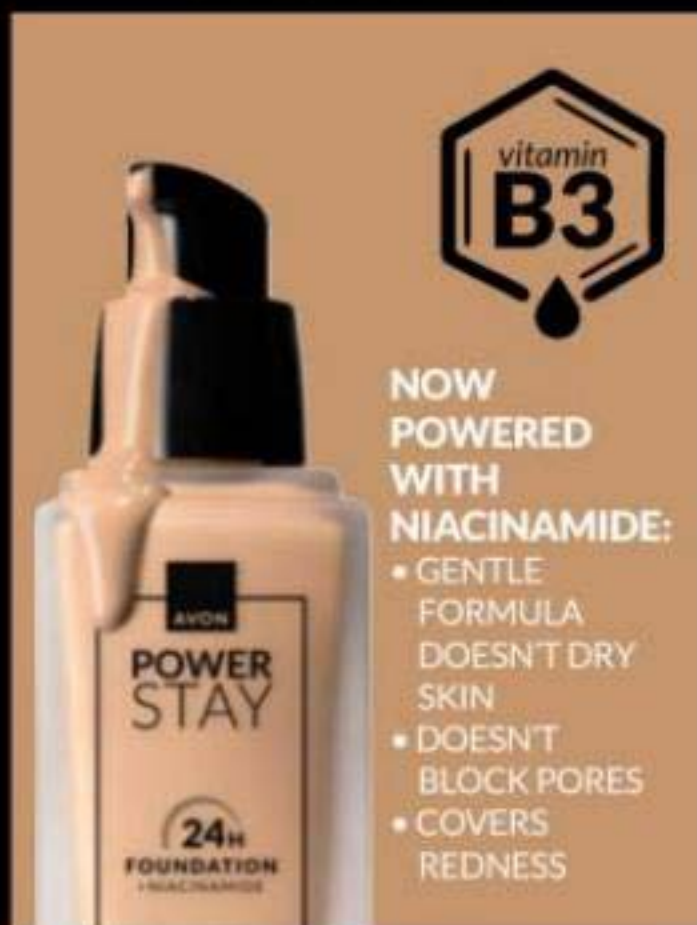
THE POWER STAYS