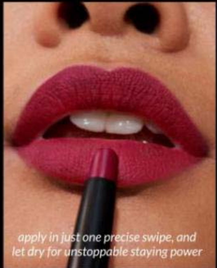
apply in just one precise swipe, and let dry for unstoppable staying power