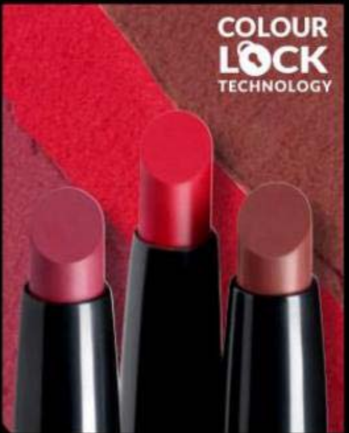
THE PRECISION STAYS