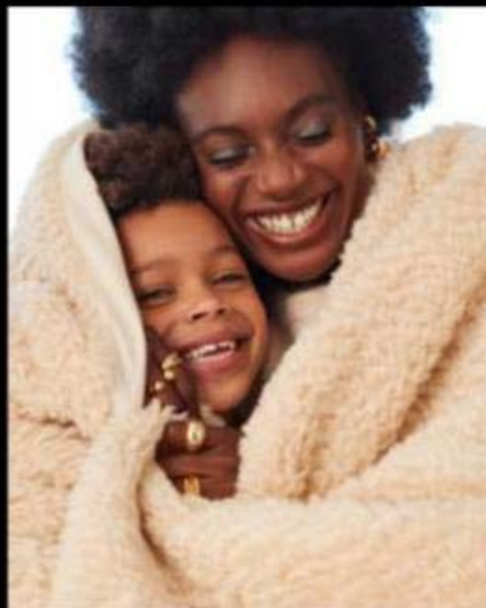
THE HUG STAYS