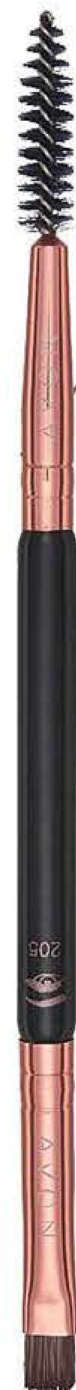
Eyebrow Duo Brush 06577 £4