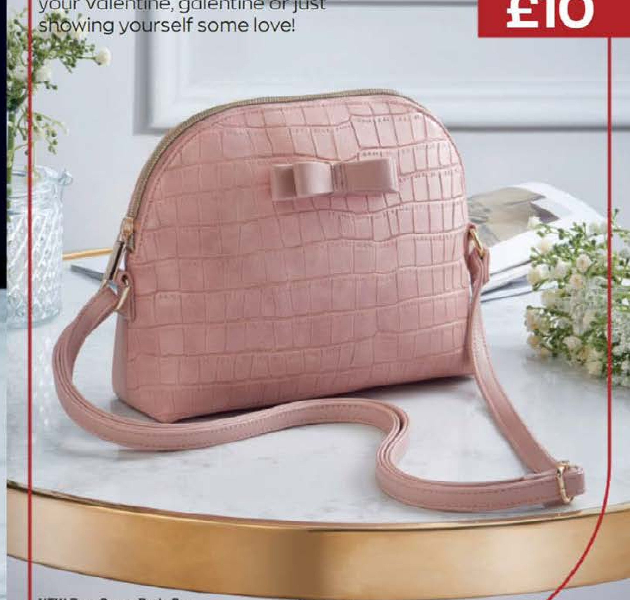
NEW Bow Cross-Body Bag Outer: PVC. Lining: polyester. Approx. 21.5cm x 6cm x 18cm. 35543 £10