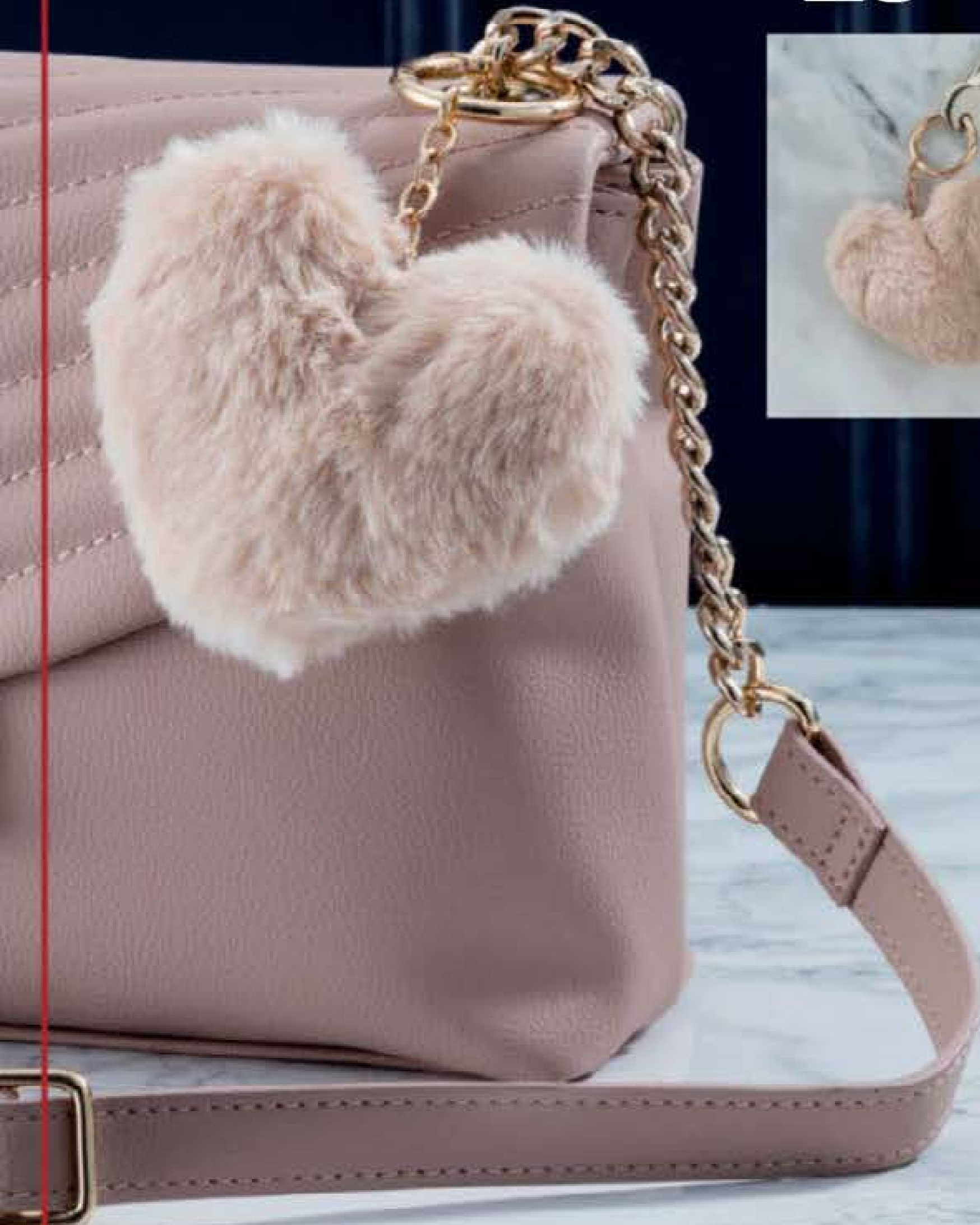
Heart Pom Pom Keyring Faux-fur pom-pom with copper-tone chain. 63602 £3.50